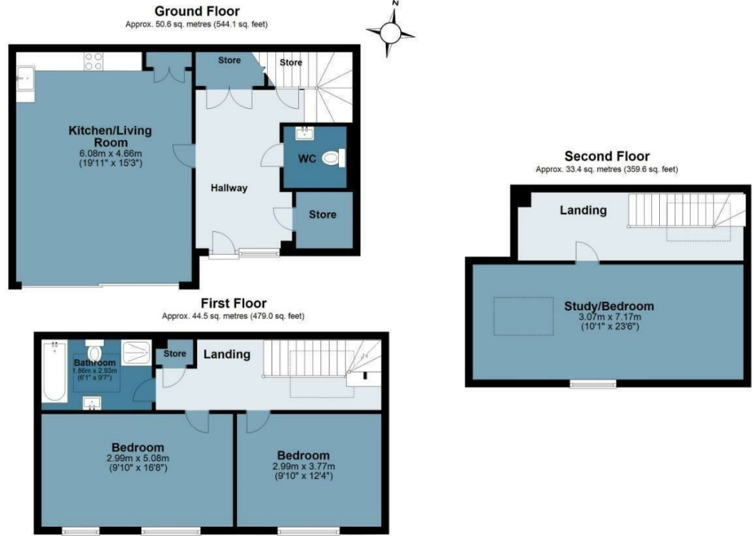
Floor plan is for illustrative purposes only and is not to scale. Every attempt has been made to ensure the accuracy of the floor plan shown, however all measurements, fixtures, fittings and data shown are an approximate interpretation for illustrative purposes only.

Approx. Gross Internal Area 128.5 Sq M ( 1382.7 Sq Ft )